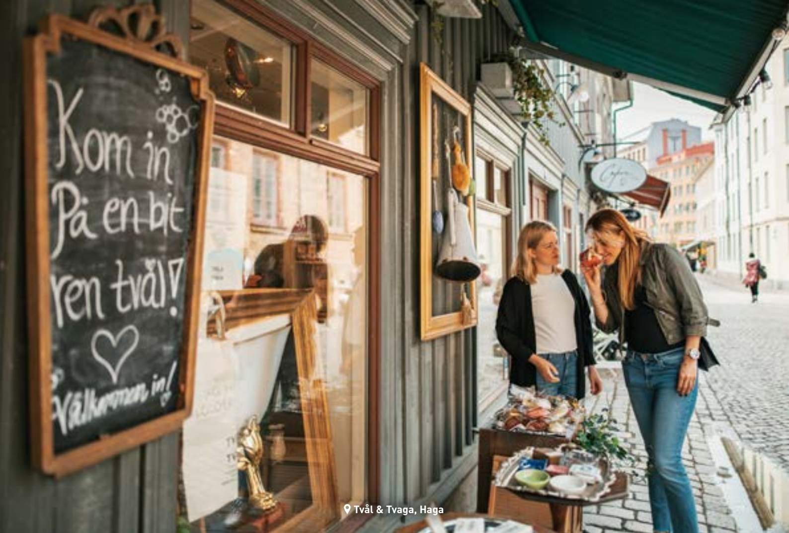
📍 Tvål & Tvaga, Haga