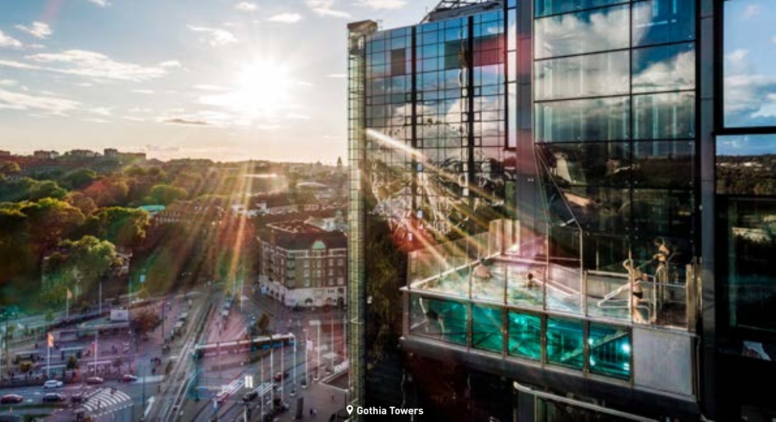
📍 Gothia Towers